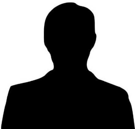
Mr Naish O'Dowd O'Dowd O'Herlihy Horan Architects 1978-1980